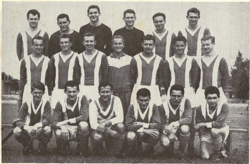
FERENCVAROSI TORNA CLUB