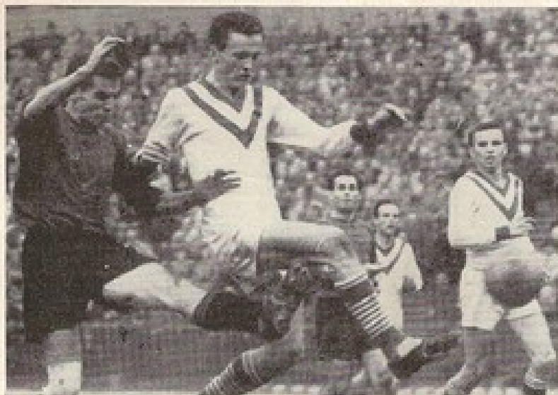
Florian Albert (centre) centre-forward